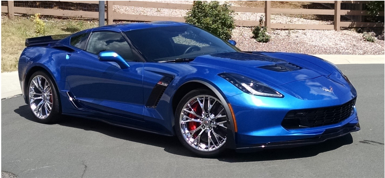
2016 Corvette Coupe Z06/Z07