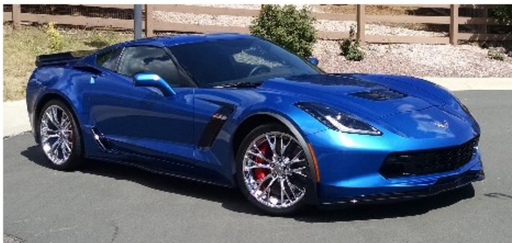
2016 Corvette Coupe Z06/Z07